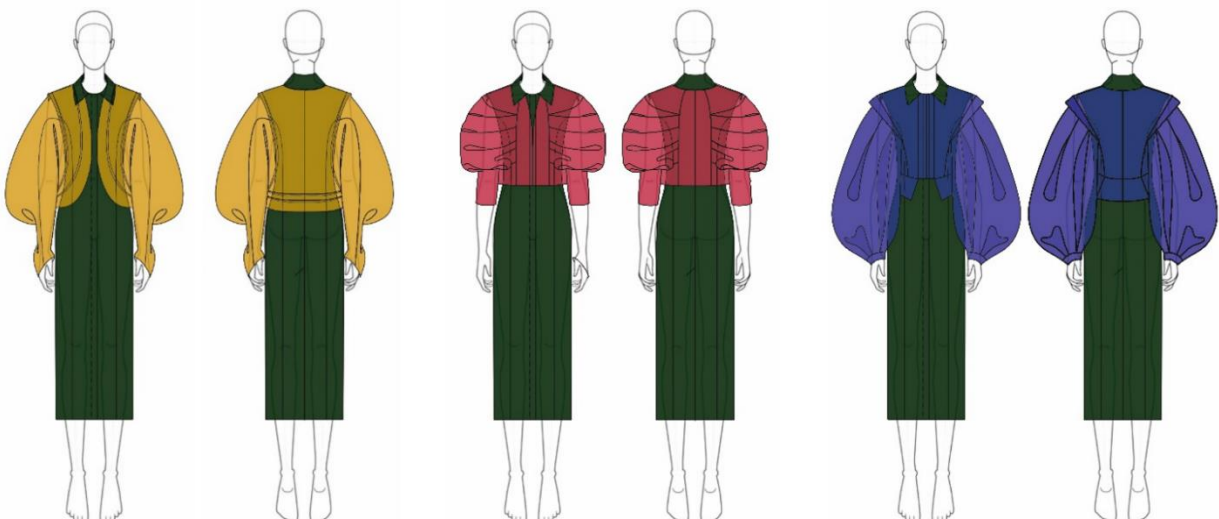
Figure 2 – Compositional and technical drawing of the images being developed

A bolero made of bright-colored coat fabric is worn over the vest, which makes the image bright, interesting and comfortable. Bolero is an accent element of the image, which can be removed or replaced if desired. The bolero design has articulations coming out of the shoulder seam and coming into the side, which create three-dimensional elements on the mill. The sleeve is one-piece, having a rounded configuration of the middle seam and a curly bottom line. With articulations coming out of the armhole and coming into the bottom line, and vertical pinches at the bottom of the sleeve (V. V. Getmantseva, 2016, 34-57). A technical sketch of the bolero, as well as alternative models of the top, is shown in Figure 2.